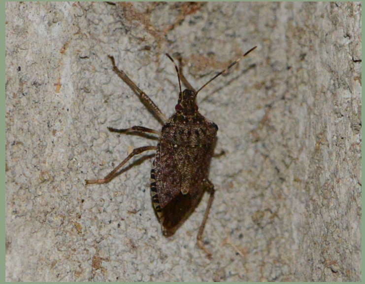
Figure 1. Brown marmorated stink bug can squeeze through cracks less than 1/6 inch wide (Photo: Ric Bessin, UK).

Of these, brown marmorated stink bug is usually the first to search for protected places to spend the winter. Multicolor Asian lady beetle begins seeking refuges a month or more after the stink bug. Homes that have had a history of unwanted fall invaders should expect problems in the future.